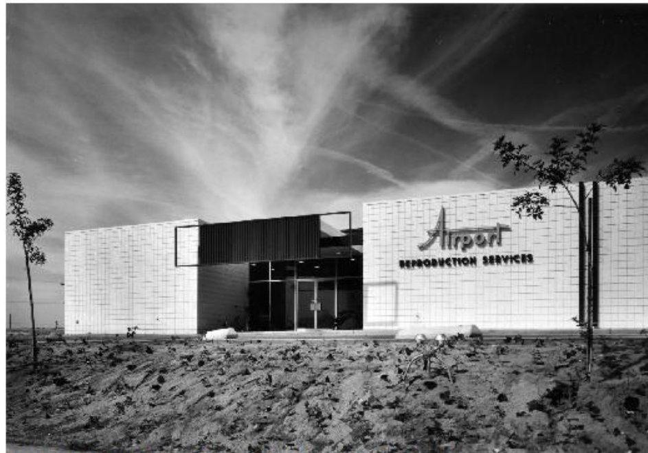
Airport Reproduction Services, San Diego, 1961. P&K Project No. 5757. Julius Shulman Photo 3272-2.